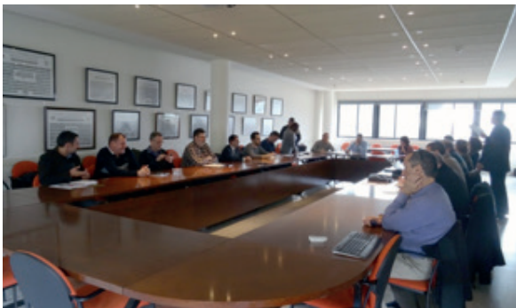
Fig. 1. UAB MOBILITY BOARD meeting, February 2015