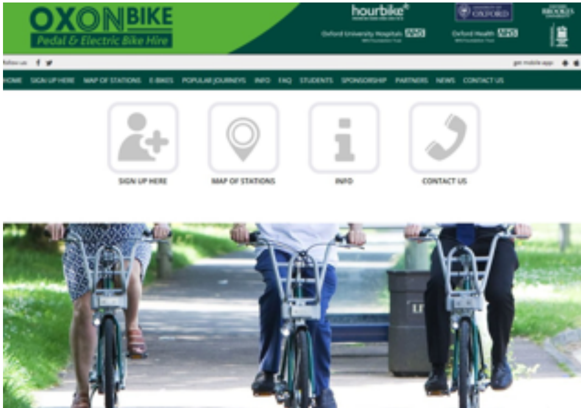
Fig.1. Oxonbike website.