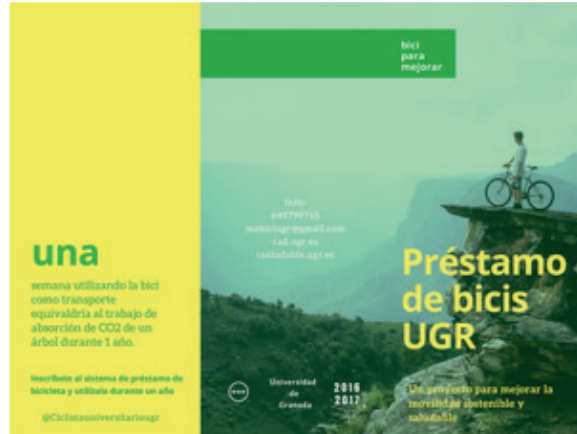
Fig 2. Advertising for the UGr bicycle sharing system