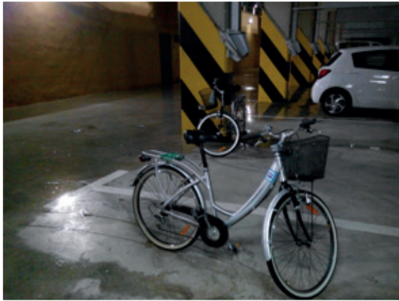
Fig 1. UGr bicycle