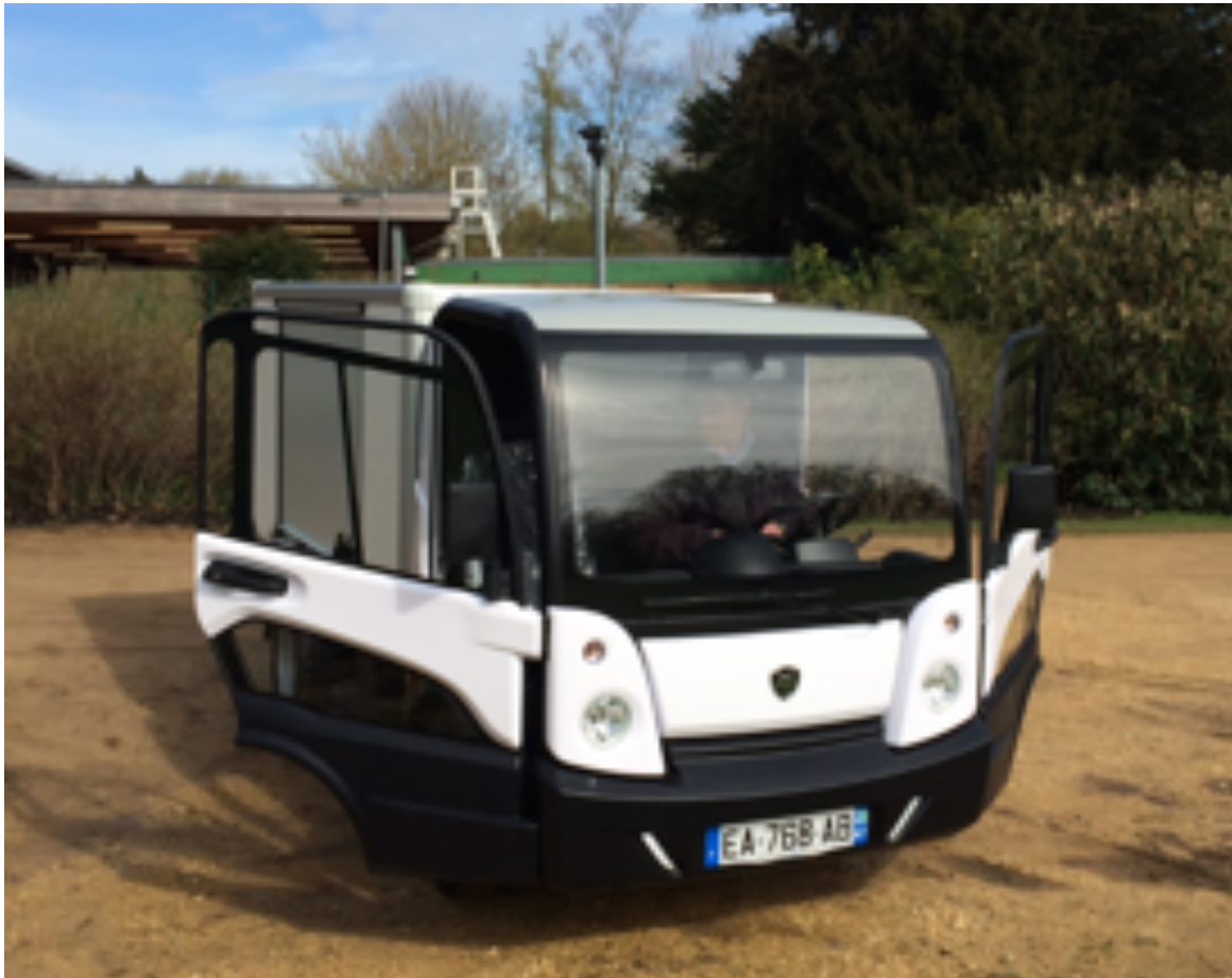
Fig 1. Goupil G5 Electric Tipper