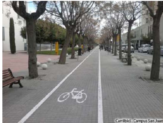
Fig. 4. Bike lane at Campus San Juan