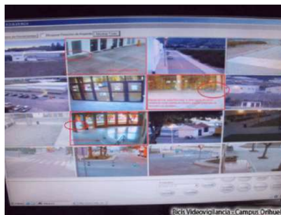
Fig. 2. Video surveillance service for bikes