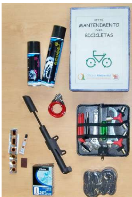
Fig. 1. Bicycle Maintenance Kit