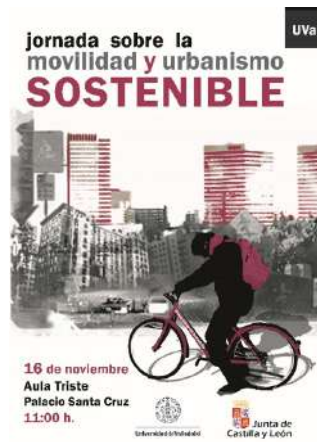
Fig. 1-2. Poster of the Mobility Conferences