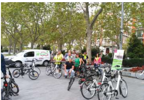
Fig. 2. Bike tour