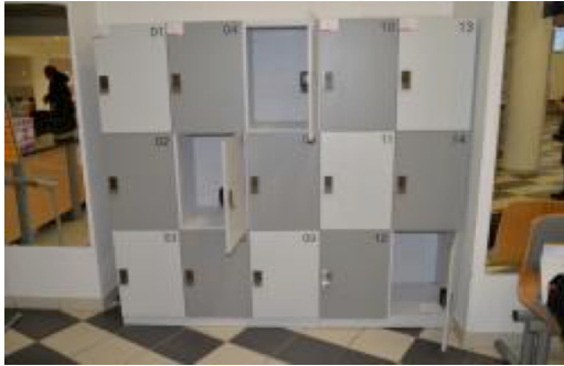
Fig. 3. Deposit lockers at the Faculty of Management and Economics