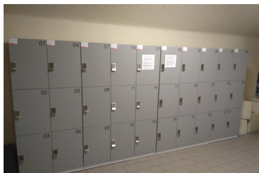
Fig. 2. Deposit lockers in the Main Building near the locker room