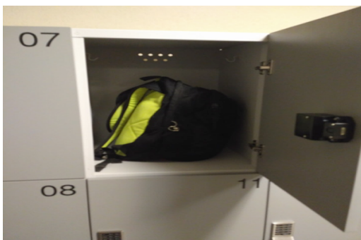
Fig. 1. Deposit lockers at the Gdańsk University of Technology