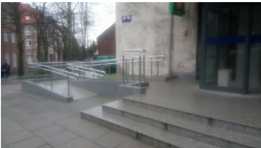
Fig. 1. Entrance area to the "B" building of the Gdańsk University of Technology after the renovation