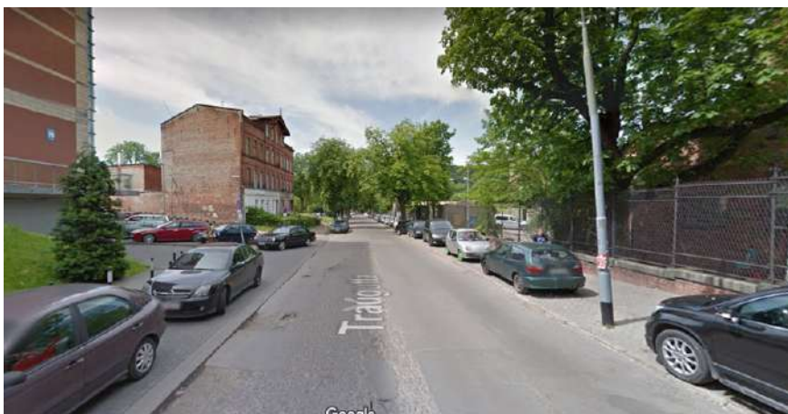
Fig. 1. The area before modernization