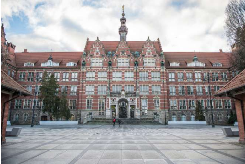
Fig. 2. Square in front of the Main Building - open space after the implementation of the project. [2]