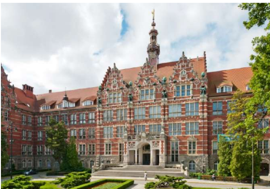
Fig. 1. Square in front of Main Building - with the possibility of car traffic before the implementation of the project, source [1]