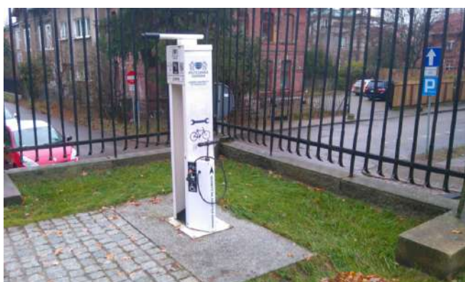
Fig. 4. Equiped self-service repair station, located near the parking lot