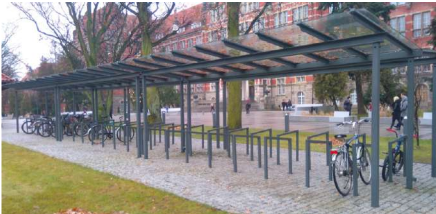
Fig. 1. Covered parking in front of the GUT Main Building