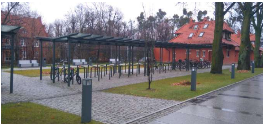
Fig. 2. Covered parking in front of the GUT Main Building - side view