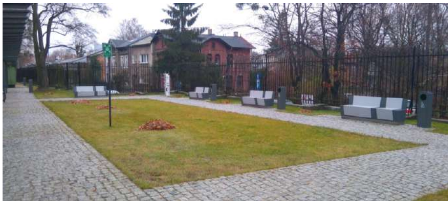
Fig. 3. Space behind the parking lot