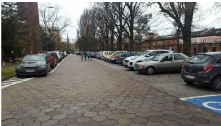
Fig.4. Road with authorized car traffic and designated parking spaces