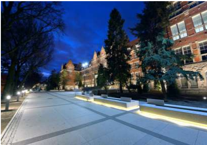
Fig. 1. Concrete, backlit seats with a granite-like cover, along the illuminated zone