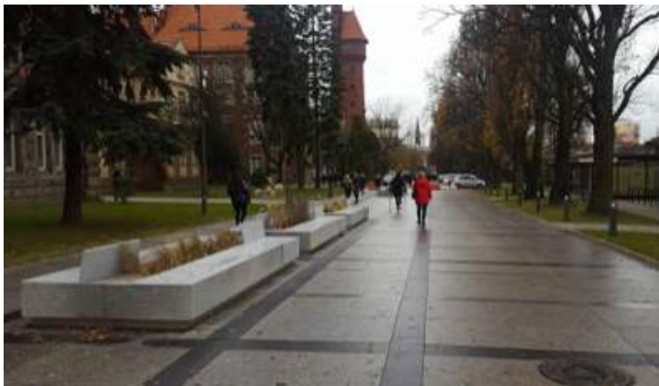
Fig. 2. A view of the whole road to Novum, with benches