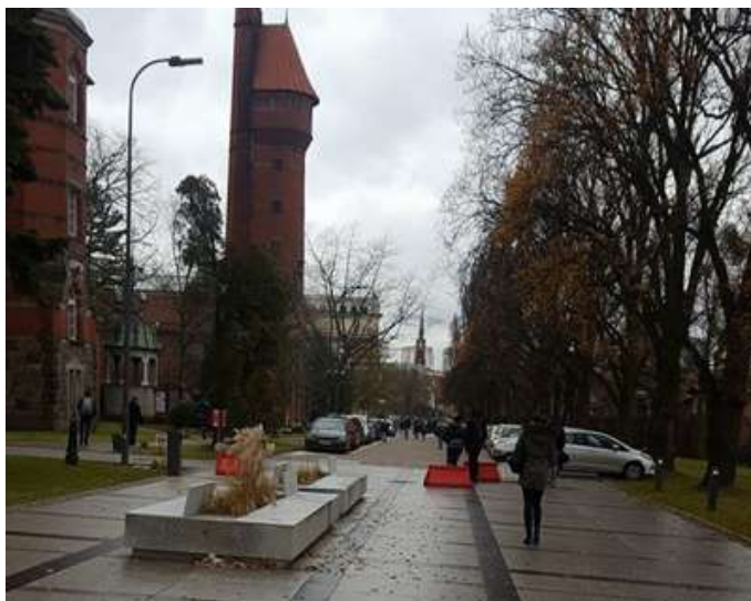
Fig. 3. The end of the car-free zone, separated by traffic cones