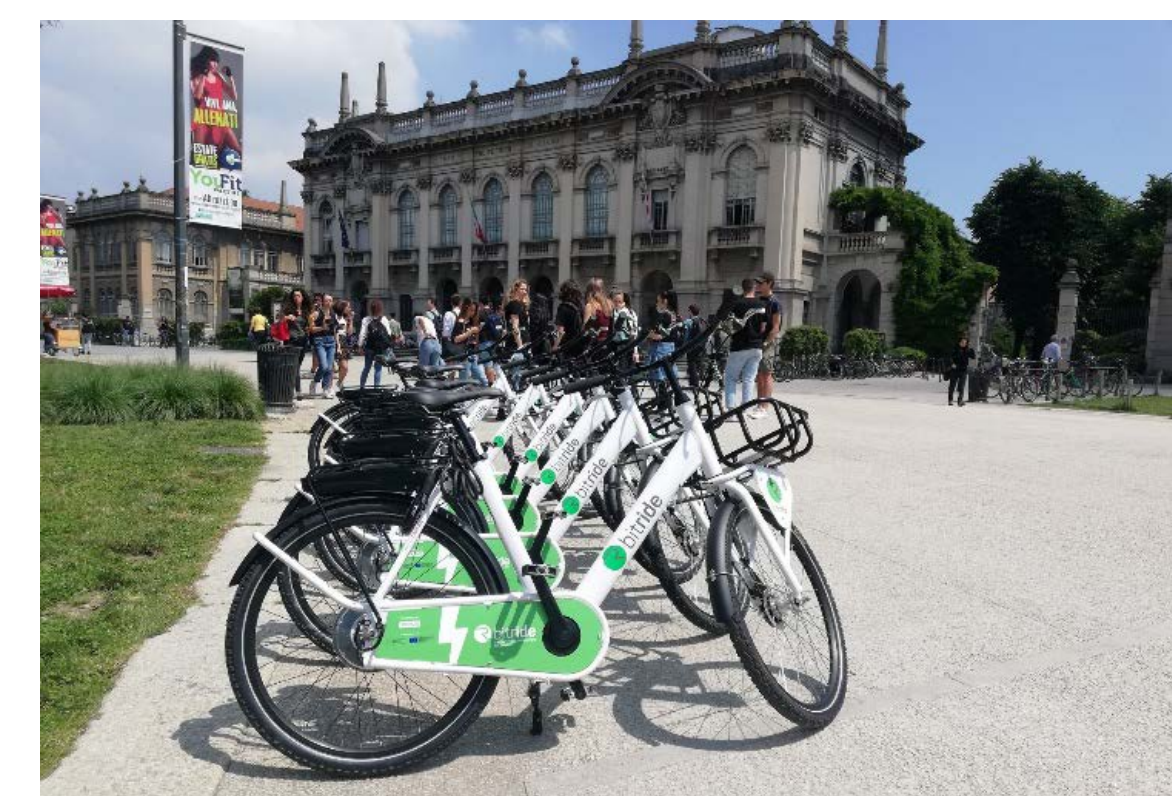
Figure 3: The hybrid-floating bike sharing service tested on campus.