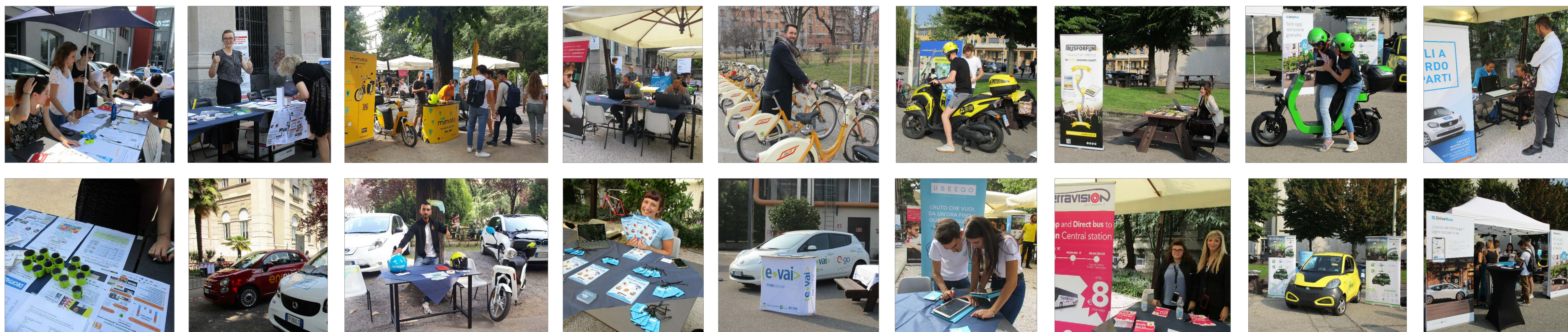
Figure 2: Initiatives on campus to promote sustainable mobility.