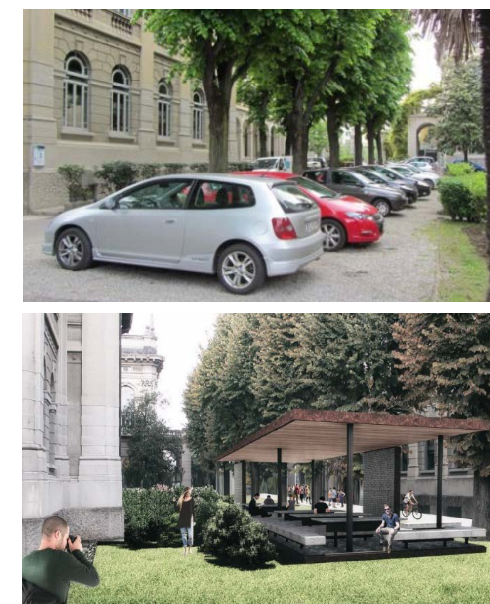
Figure 1: The Leonardo Campus before (above) and after (below) the Vivi.Polimi renewal.

Meanwhile, our main campuses are currently undergoing a renewal process, thanks to the projects by Renzo Piano and VIVI.POLIMI, which will also reduce parking spaces on campus to further discourage the use of private cars.