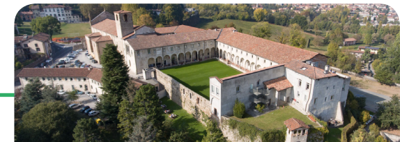
BERGAMO 2021 (ONLINE)